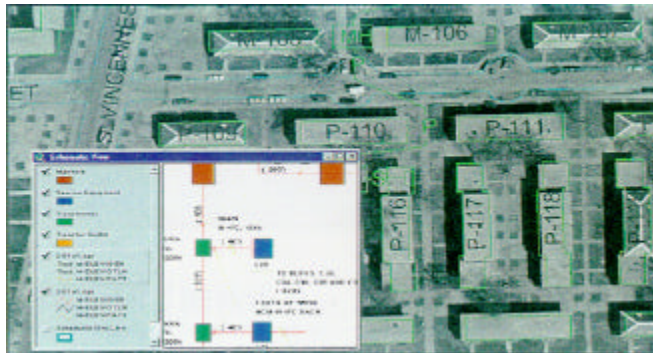
Data from the handheld device are linked with existing CAD drawings and aerial photography, improving data intelligence

During field trials and subsequent implementation, the system exceeded expectations. Using the handheld computers, each field team views CAD site drawings and enters information for each feature type, building